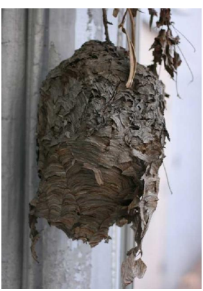
Hornet's nest containing the queen, workers, eggs, larvae and prey (food)

Pupae –All have a pupal stage, during which the adult form develops. In velvet ants, which are not actually ants, only males develop wings. All pupae are exarate (the appendages are free and visible as they develop). (Click images to enlarge or orange text for more information.)