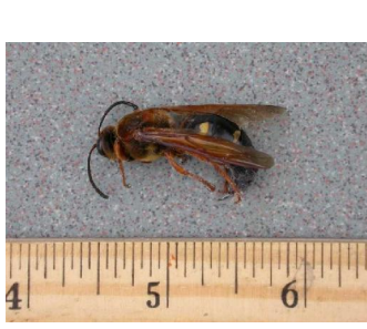
The largest wasps use their size to intimidate, not sting