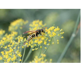
Not all black & yellow wasps are yellow jackets