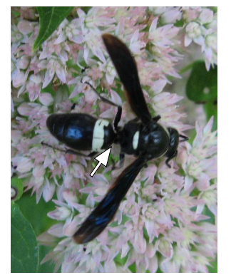
Cinched in waist

Adults –Stinging wasps have hard bodies and most have membranous wings (some are wingless). The forewing is larger than the hindwing and the two are hooked together as are all Hymenoptera, hence the name "married wings," but this is difficult to see. Some species fold their wings lengthwise, making their wings look long and narrow. The head is oblong and clearly separated from the thorax, and the eyes are compound eyes, but not multifaceted. All have a cinched-in waist (wasp waist). Eggs are laid from the base of the ovipositor, while the ovipositor itself, in most species, has evolved into a stinger. Thus only females have stingers. ( Click images to enlarge or orange text for more information. )