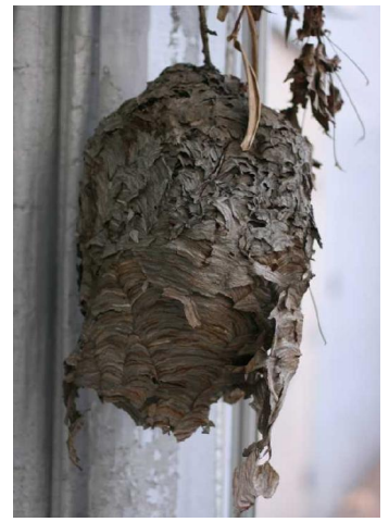
Dangerous when approached otherwise beneficial

Comments –Stinging wasps are classified in the order Hymenoptera, Suborder Aculeata. The term "stinging wasp" is simply a term of convenience for all species in the suborder Aculeata except bees (Superfamily Apoidea). Although ants (Superfamily Vespoidea, Family Formicidae) are classified as stinging wasps, there is a separate page dedicated to ant identification.