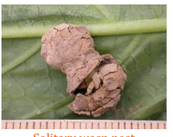
Solitary wasp nest

Larvae –All are vermiform (worm-like), so they have no legs, no prolegs, no wings, no wingbuds. Heads are difficult to discern. They produce no frass. Larvae are rarely seen, as they are either tended inside a colony or are provided with food by a solitary female and left inside an individual nest, sometimes made of mud or paper. ( Click images to enlarge or orange text for more information. )